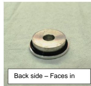
Back side – Faces in

Install restrictor so flush side of restrictor is facing outward. Ensure o-ring on front & back of restrictor are in place.